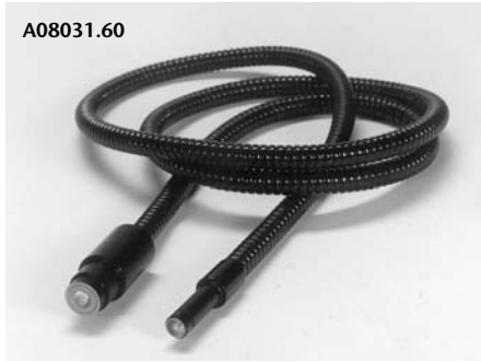
Single Bundle, A08031.60